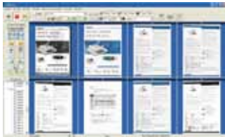
The AVScan X main screen

-The Intelligent Document Management Tool