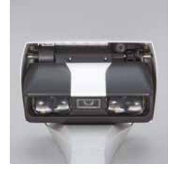
Large depth of field lens

Maximised auto focus area even when the focus distance is variable